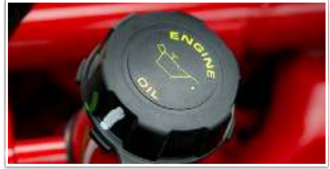
Routine service points are clearly labeled and easily accessed under the hood