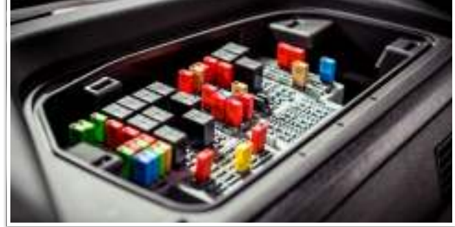
In-cab electrical panel is protected from the elements and conveniently located under spill-resistant dash panel